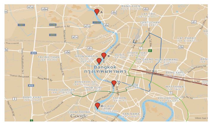
Figure 2. The Geographic location and sampling points of study area

The sampling points is 5 points: A is Thanomnon (13.841949, 100.491073), B is Tea-wate (13.772133, 100.500098), C is Pra-a-tide (13.763545, 100.494025), D is Sipraya (13.728406, 100.513178) and E is Krungtap Bridge (13.692558, 100.491907), for the Geographic location and sampling points of study area shown in figure 2.